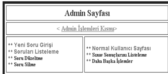
Figure 4 : “Pascal Öğreniyorum” Web Site Teacher Page

Question Entrance: It is the page that teachers enter the multiple choice questions to system.( Figure 5).