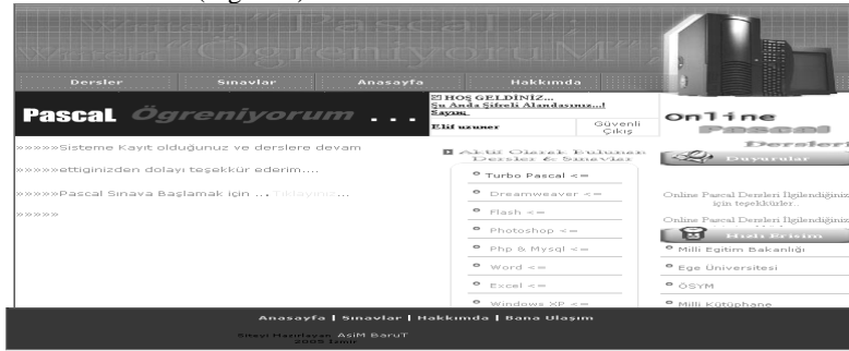
Figure 3 : “Pascal Öğreniyorum” Web site Student Page